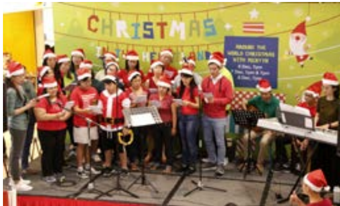
Above: Singing at Heartland Mall. Below: Balloon ambassadors!

Different choirs performed at the three sessions. On 7 and 8 December, Outreach@Assisi Group, comprising members from various parishes, sang at the Heartland Mall.