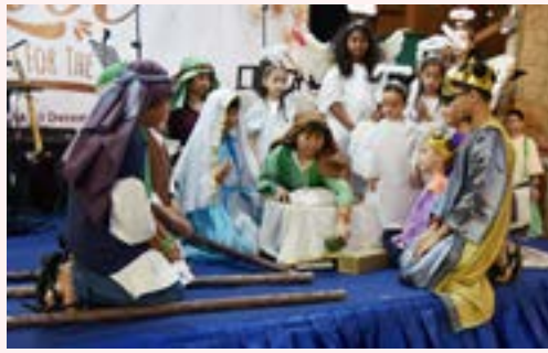
Nativity play by the children.