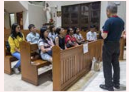
Conducting a tour of the church.