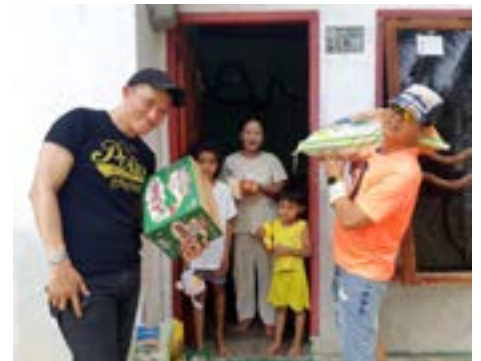
Volunteers distributing rations to the needy families in Tanjung Balai.

Parishioners who are interested to contribute can look out for Epiphany's fundraiser which is held twice a year. If you are keen to volunteer, you can check http://charis-singapore.org/web/index.php/epiphany#missions-trips for the next TeachNLearn mission trip to Tanjung Pinang or look out for the announcement in the Parish Bulletin for the next volunteer trip. ❤️