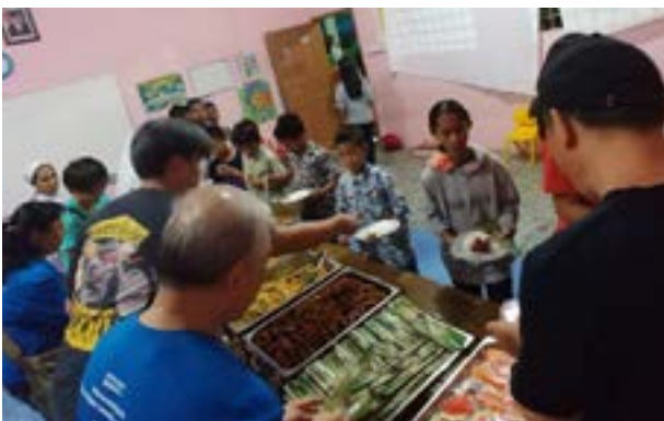
Volunteers serving dinner at the Asrama Francis Xavier.