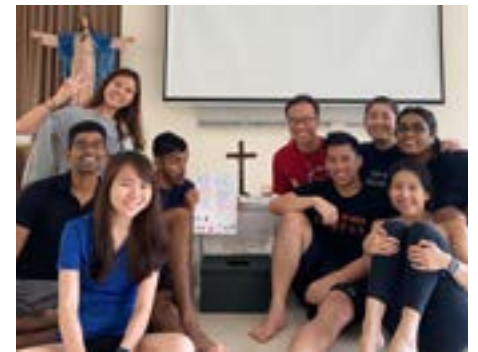
RCIY members on their recent retreat.

Youth Catechists hold weekly sessions on Saturdays. These sessions and regular retreats have