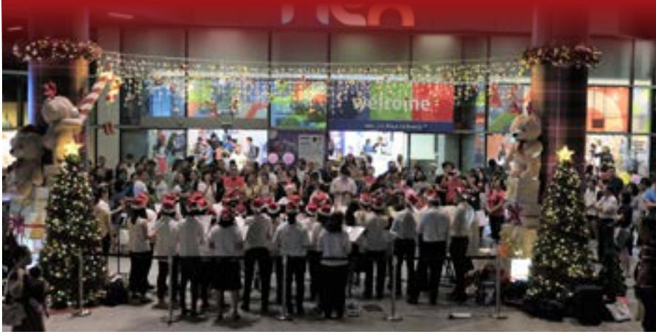
The combined choir performing for the evening crowds at Nex shopping mall.

CHRISTMAS is generally a time for gift-shopping and feasting. To show our neighbours a different perspective, our parish held three outreach sessions at the nearby shopping malls, with the intention of inviting them to our Family Fiesta on 28 December.