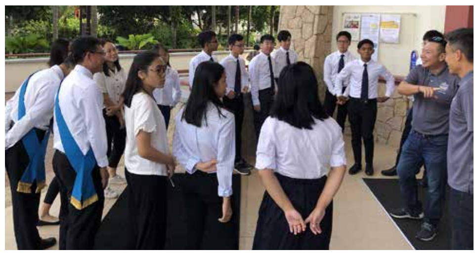
(Above & below) Learning the ropes of the Hospitality Ministry.