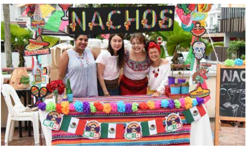
The Mexican stall hosted by the Lectors