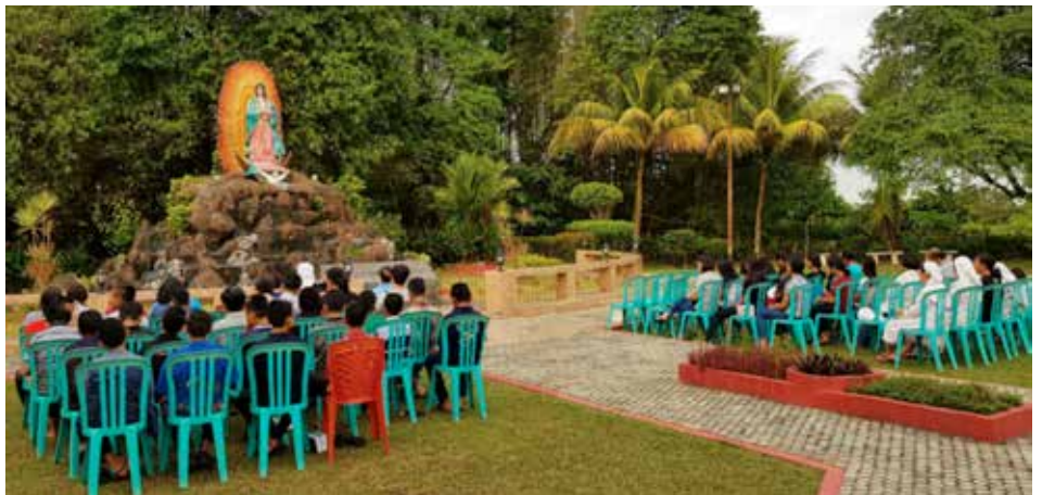
Praying the rosary with the students at the Our Lady of Guadalupe grotto.