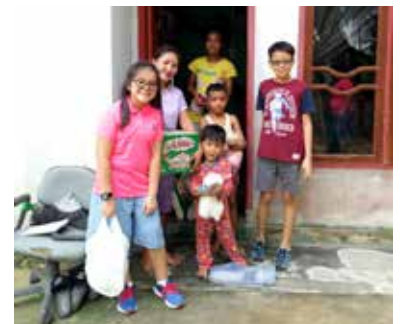
Volunteers with rations for a family.

joyful. I will come back again if I get a chance."