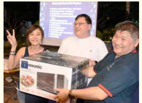
The evening had something for everyone!