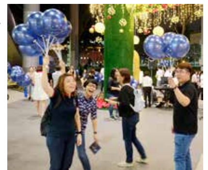
Top: The Myanmar community choir at Heartland Mall. Middle: The combined choirs performing at NEX. Right: Parishioners distributing balloons. They also helped in giving out flyers to the public to join our Family Fiesta. Left: The Alpha choir performing at Heartland Mall.