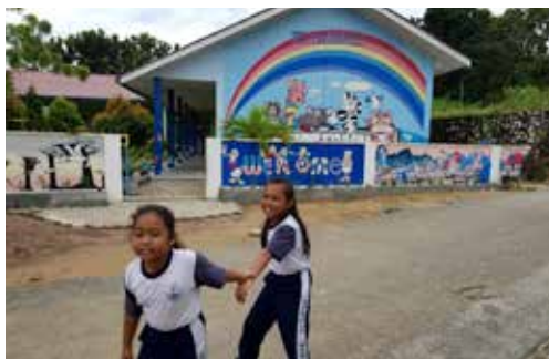
The San Immanuel primary school.