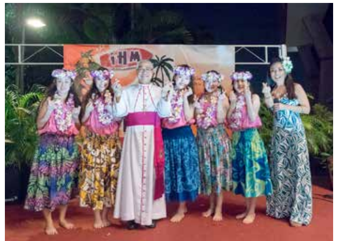
The Halau Hula Kealohilani Dance School (above and right with Archbishop) entertained the crowd with five Hula dances.