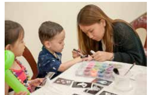
Fun for the kiddies...