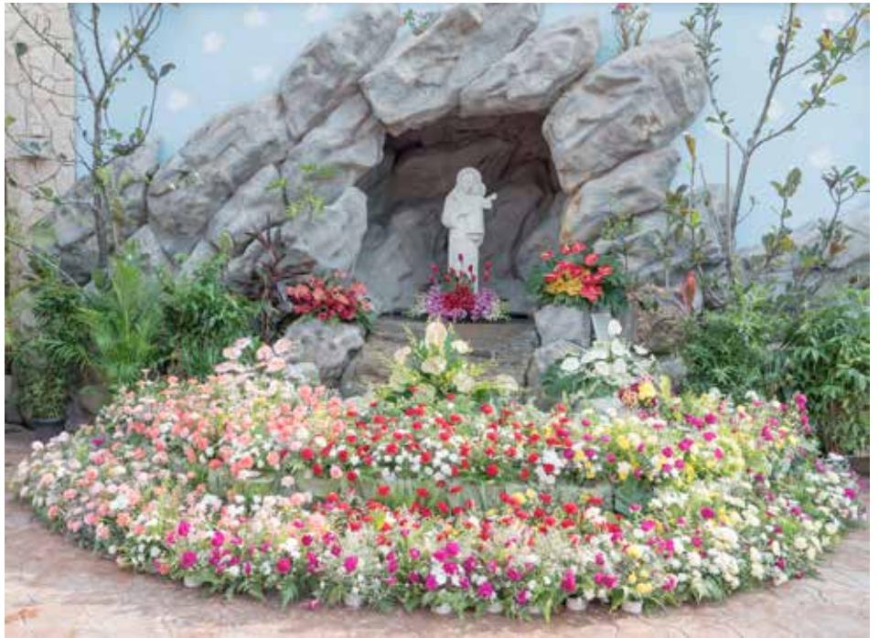
Our Lady's grotto decorated with bouquet upon bouquet of flowers for the occasion.