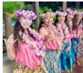
The happy crowd.