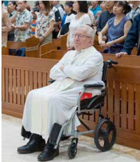
Our parish priests.