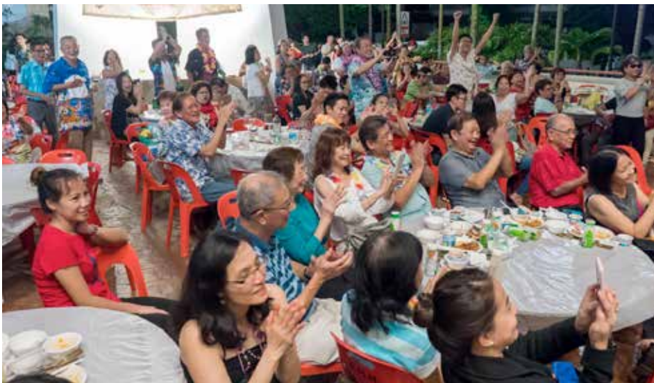
...and fun for the adults!