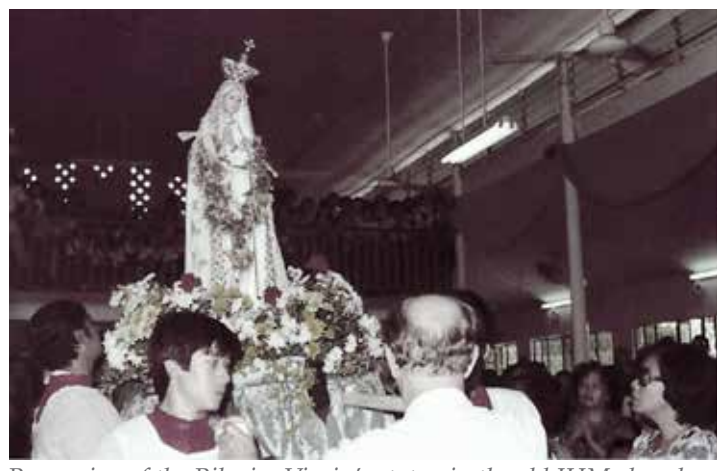
Procession of the Pilgrim Virgin's statue in the old IHM church.