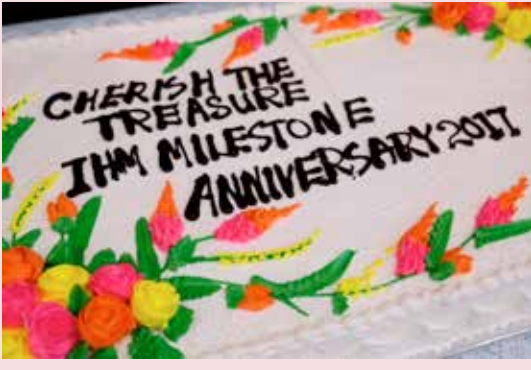
The anniversary cake