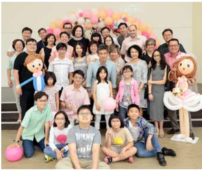
The Family Life group with some of their children, who also pitched in to help

especially with the management of before and after videos. When asked if they would do it again the team unanimously agreed they would, in a heartbeat. In fact, four out of the nine couples will be celebrating their wedding milestone anniversary next year, leaving them more excited than ever to plan next year's event.