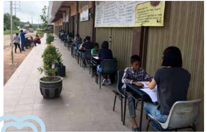
E piphany: TeachNLearn volunteers from the group are seen conducting English oral tests outside St. Ignatius school in Taroka, Batam. They also assess students in Rempang. Each school needs the services of 18 volunteers. ♥