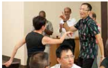
The Bootscooters (left) and folks from the parish showing off their dance moves!