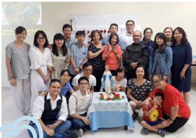
S ingapore Catholic Deaf Community: Group members honoured Mother Mary in a special way during the month of May with an interactive rosary. ♥