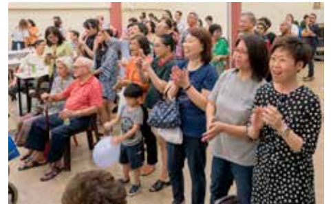
Everybody had a good time!