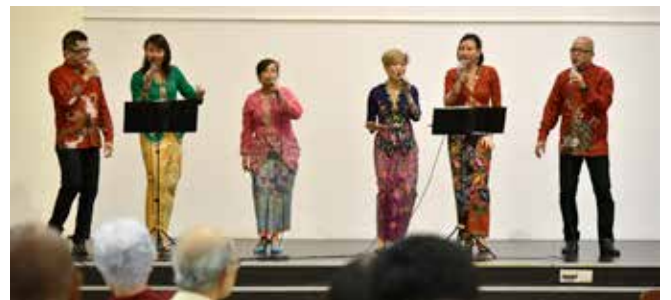
The group Peranakan Sayang crooning familiar songs...