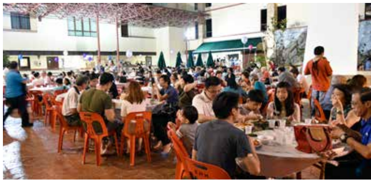
Makan and movies under the stars on the piazza!