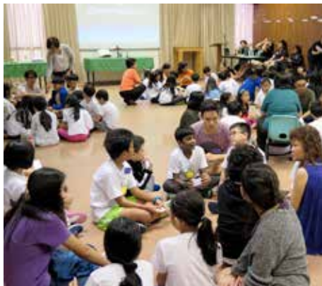
Group discussion at the camp...