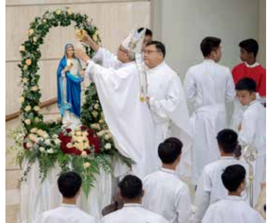
Placing the crown on the statue of Mother Mary.