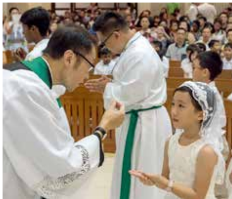
Receiving First Holy Communion.

Starting last year, a separate session for parents of the Primary