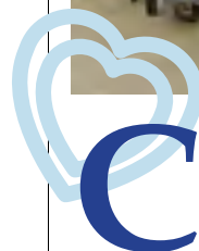
C harismatic Prayer Group: Members of the group raise their hands to praise God at their recent Life in the Spirit Seminar. ♥